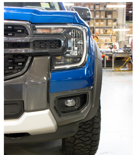
2022 Ford Ranger Sport Next Gen, Double Cab