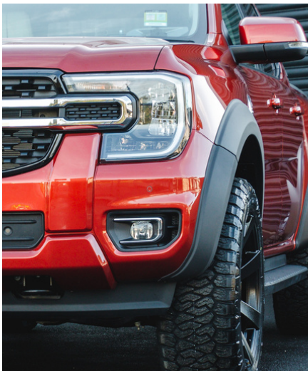
2022 Ford Ranger XL | XLT Next Gen, Double Cab