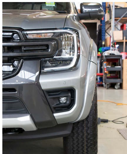
2022 Ford Ranger Wildtrak Next Gen, Double Cab.